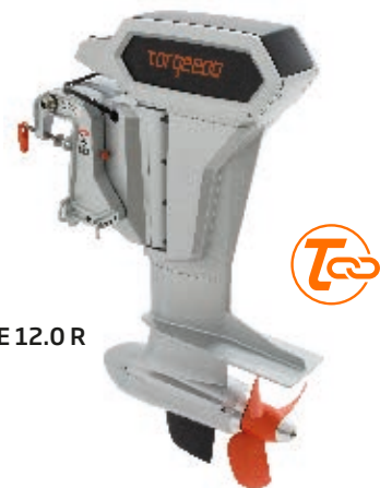
CRUISE 12.0 R