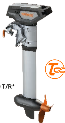
CRUISE 6.0 T/R*