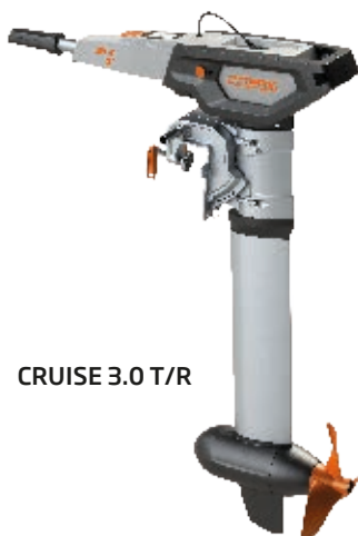
CRUISE 3.0 T/R

You can choose from either remote steering or tiller-equipped Cruise 6.0 outboards, which are 9.9 HP-equivalents for boats up to 6 tons. Cruise 12.0 is a 25 HP-equivalent outboard with remote steering for boats up to 12 tons. Cruise 6.0 R and 12.0 are compatible with a wide variety of TorqLink throttles.