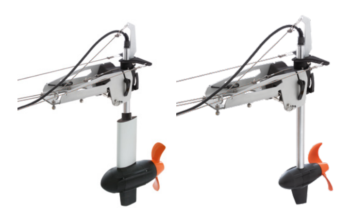
ULTRALIGHT 1103 AC

Professional kayak anglers don't hit the water without their Ultralight, and neither should you. With the Ultralight 1103 AC, you can beat the crowd and get to that coveted spot more than 30% faster. The whisper-quiet, direct-drive Ultralight 1103 AC comes with the innovative angler mount and all the high-tech features you've come to expect: GPS built in, real-time range and runtime display, solar charging, superior safety and performance, and the latest lithium battery technology. The 1103 AC is almost three times more powerful than the Ultralight 403 for the ultimate in acceleration and pulling power, and adds instant throttle response for improved manoeuvrability and a heavy-duty construction with more resistance to impact damage.