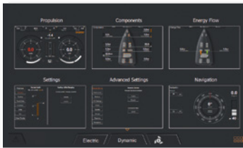
Main menu: Navigate easily between different categories.