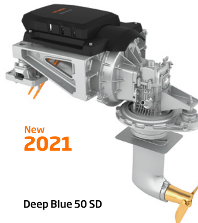
Deep Blue 50 SD