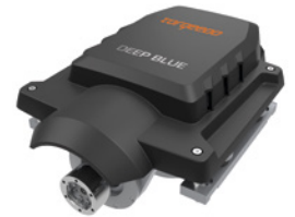
Deep Blue 25/50 i