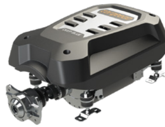
Deep Blue 100 i 900

Torqueedo now offers a new power range of electric sail-drives, integrating the proven drive train technology of Deep Blue with saildrive legs from ZF. The quiet, emission-free fixed saildrives are reliable components for environmentally friendly bluewater sailing. Both saildrives are designed for sailing speeds up to 30 knots for high-performance sailing and efficient hydrogeneration, keeping your system charged while under sail. Deep Blue 50 SD easily mounts on Yanmar engine beds. Deep Blue 100 SD is a custom integration - contact us during your design-in phase.