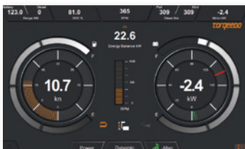
Drive screen: All important information needed while motoring. You can choose to display or hide the information line at the top.