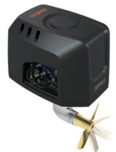
Deep Blue 25 SD