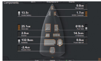
System management: Provides status data on all system components.