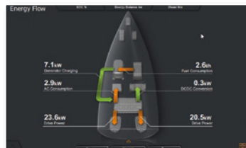
Energy flow: Understand your system's power balance & energy flow at a glance.