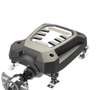
Deep Blue 100 i